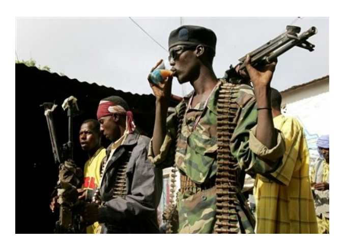
Militia from the Islamic Courts Union

was nearly eliminated by the rise of the Islamic Courts Union (ICU). The ICU cracked down on the pirates and came close to reunifying and bringing peace to the war-torn nation. The ICU failed in this endeavor because of the combined interventions of Ethiopia, which invaded Somalia with its land forces, and the United States, which began funneling support to the old Somali warlords, now calling themselves the "Alliance for the Restoration of Peace and Counter-Terrorism." Both Addis Ababa and Washington intervened because they shared the fear that the establishment of the ICU would be a key victory for "Islamic radicalism" and might serve as a potential base for Al-Qaida. Ethiopian leaders also faced the additional problem of Somali separatist forces operating within the Ogaden region along the border with Somalia.