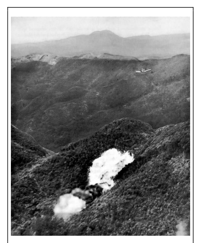
Firebombing in Northern Okinawa

Fighting in the Battle of Okinawa (late March to late June, 1945) was sporadic around Henoko, and in the northeastern part of the main island generally. Still, Henoko residents died in artillery fire and bombing raids, which forced many to abandon their homes for refuge in nearby hills and forests.