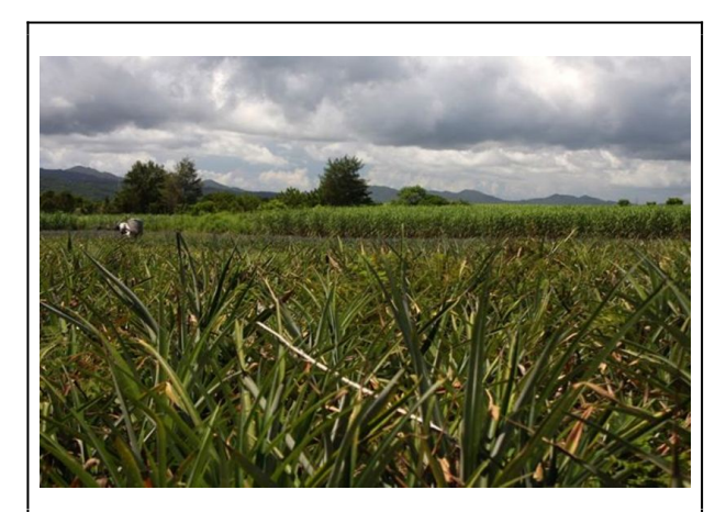
Pineapple farm in Northern Okinawa. Tea and sugar are also widely grown.

What Inoue calls an "entertainment quarter," officially termed an "amusement area" by the U.S. military, was located on a plateau of high ground separated from residential Henoko below by a sharp embankment. Both sections of the village were accessible from the main highway that ran along the eastern coast of Okinawa, but, as if to keep them separate, they were connected only by a steep and narrow dirt path through high grass and trees on the hillside between them. After construction of the two bases in 1959, the population of Okinawans in Henoko swelled to approximately 2100 residents and 900 transient workers.<sup>17</sup> A bus terminal was built in the residential section to serve the growing number of commuters working base-related jobs, while a fleet of taxis based in the "amusement area" served the generally more affluent American G.I.'s, few of whom rode the buses.