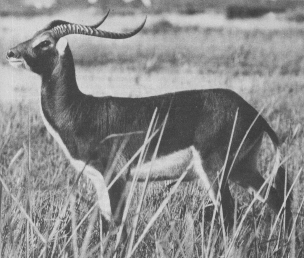
Male BLACK LECHWE, and below a SITATUNGA disturbed from his wallow by the aeroplane