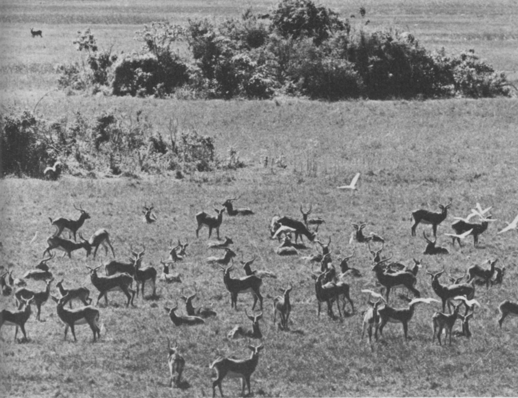
HERD OF BLACK LECHWE MALES MIXED HERD IN FLIGHT