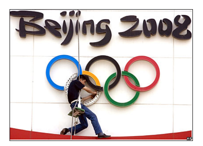
Beijing prepares for 2008 Olympics

As for the suggestion that if such an event can occur in China then China is not qualified to host the Olympic games, it is simply indicative of the shallowness of Japanese refusal to confront the serious problem we face.