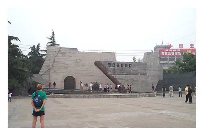
Memorial and Museum for Nanjing Massacre

The strengthening of nationalistic education in China can be traced back to the Japan's history textbook controversy of 1982. The importance of resistance to Japanese aggression in China's nationalistic education is clearly demonstrated by the construction of the Nanjing Massacre Museum in Nanjing and the Memorial Hall to the Chinese People's Anti-Japanese War immediately adjacent to the Marco Polo Bridge, site of the outbreak of the Sino-Japanese War. Both museums, their names written in glittering gold characters, were constructed under Deng Xiaoping's instructions. Japan's history textbook controversy stirs Chinese memories of Japan's war of aggression against China which unfolded after the May Fourth Movement of 1919. The May Fourth movement was not only directed against Japan's Twenty-One Demands, it is the very embodiment of China's nationalist movement. The fact that Japan has shown not the slightest sincerity toward learning from the past has fostered deep Chinese suspicion.