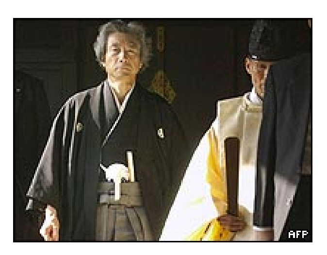
Prime Minister Koizumi at Yasukuni Shrine

Prime Minister Koizumi would never have visited Yasukuni Shrine at the start of 2004 if he had taken seriously the precariousness of relations with China and been aware of the importance of avoiding further deterioration in China-Japan relations. Nevertheless, the Prime Minister insisted on visiting Yasukuni Shrine as if no issue existed. The Chinese perceive Japan and the Japanese people as refusing to seriously recognize their responsibility as victimizers in the invasion of China.