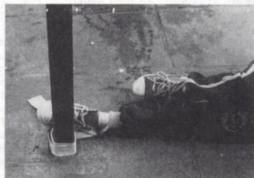
The Children's Unit – a form of restraint.