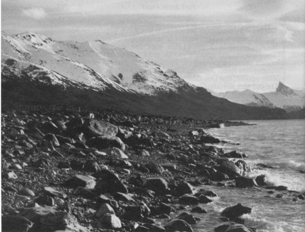
Above LAGO ARGENTINO IN WINTER Below THE MORENO GLACIER J. Boswall