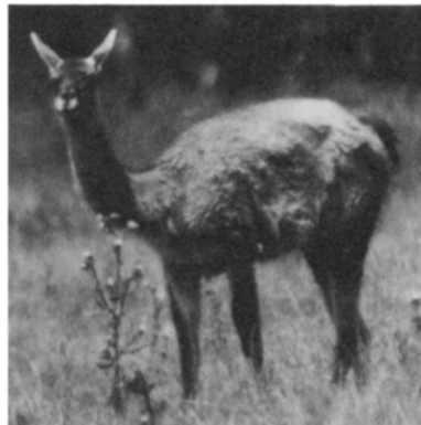
ADULT GUANACO The young are hunted with the bolas, an Amerindian weapon, consisting of three stone balls connected by leather thongs. The bolas is swung round the head, released and then entangles the quarry's legs bringing it down.