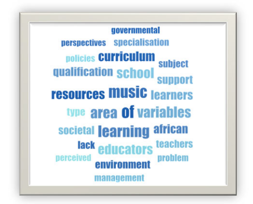
Figure 3. Word Cloud - Klopper (2005) variable research study.