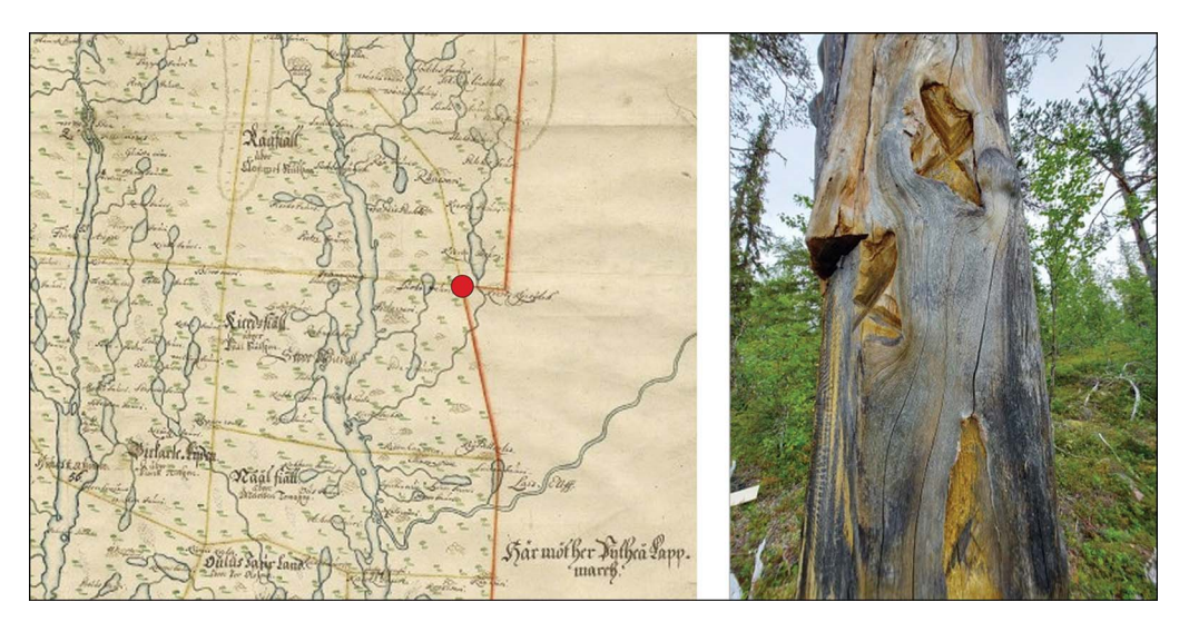
Figure 3. Map dating to 1671 showing the boundary lines between taxation lands within the Ume Sámi district (Ume lappmark) and the boundary between the Ume and Pite Sámi districts (red line). The red dot, which corresponds with a 'kink' in the boundary line, marks the location of a tree (pictured to the right) with four distinct X-marks made with an axe. The tree is partly damaged by a chain saw (map after Gedda 1671).

terrain with dense forest that is difficult to survey. Around the stem are a number of small and large blazes, with either plain or complex geometric patterns made with an axe (Figure 4). The blazes and marks were made on different occasions. In contrast to the more prominent location of the X-marked trees in the Suorssá area, this tree occupies a hidden location rather than an exposed one. Altogether, the repeated visits to the tree, the diversity of signs and the hidden location point to the tree being the object of religious activity and thus the site is interpreted as a ritual site.