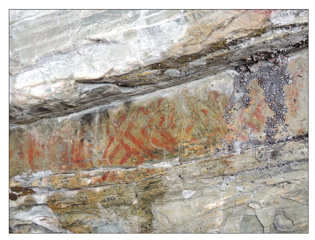
Figure 1. A c. 6000-year-old painting of geometric figures found close to the shore of Lake Gaskávrre, in the mountainous area of Arjepluovve/Arjeplog municipality.

including a head and two arms. There are two X-marks on the 'chest' that have been cut using an axe (Manker 1957). The X-marks on both the säjdde and the värromuorra are distinct, underlining the significance of this particular mark in a religious context. A depiction dating to the seventeenth century AD shows a Sámi sacrificial altar with four wooden anthropomorphic sacrificial objects placed on a platform; all have X-marks on their chests (Rheen 1983 [1671]) (Figure 2).