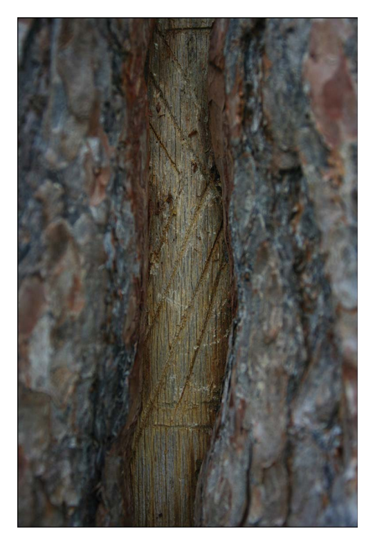
Figure 5. Knife cut geometric pattern on a Scots pine near Lake Hålgåsjávvre.

when the animistic pre-Christian religion probably dominated among the Sámi communities in this region. The tree is situated in the centre of an area containing numerous blazed trees and stone markers (typically smaller stones placed on top of large boulders). At other locations within the Vattme area such systems indicate old trap-lines (Josefsson et al. 2010b). No oral tradition persists regarding this tree or the meaning of the carvings, suggesting that they relate to conceptions and signals that have now been forgotten. The tree was still alive in 2006 (when it was found), but has since died and a woodpecker has started to destroy the pattern.