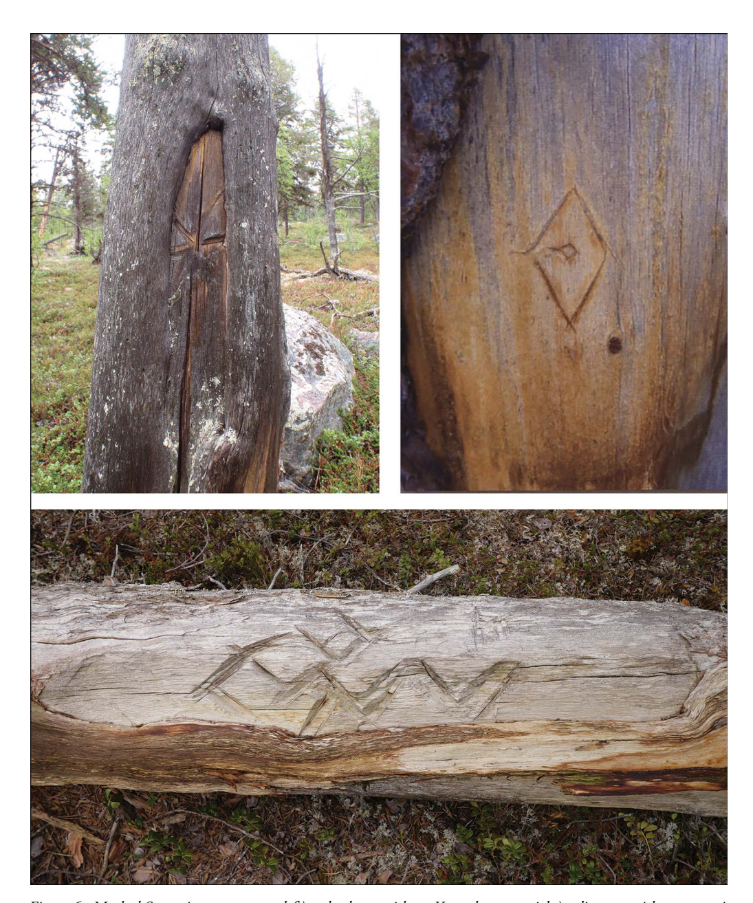
Figure 6. Marked Scots pine trees: upper left) a dead tree with an X-mark; upper right) a live tree with a geometric pattern; and below) a down log with a geometric pattern.

the carving of X-marked-signs on the trunks of the trees (Högström 1980 [1747]). This tradition persisted into recent times, although as a somewhat altered version. The significance of geometric signs in ritual practice, and X-signs in particular, is underlined by the many forms