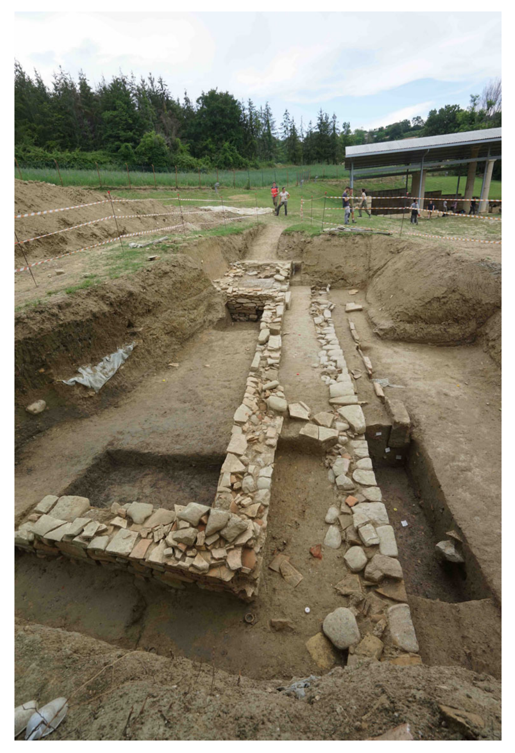
Fig. 2. The 2023 excavations showing the drain, pavement and eastern wall of Rooms C and I.