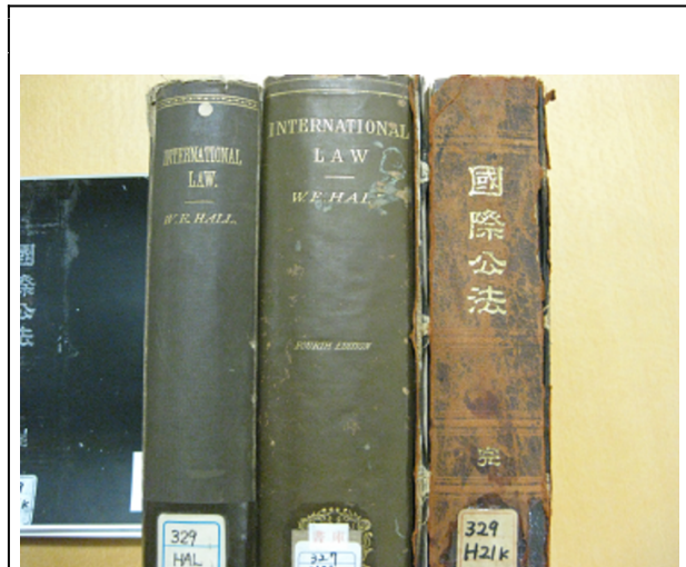
□William Hall, translated by Tachi Sakutarō, Public International Law by Mr. Hall (translation of 4 th edition of the original work) (right) published by Tokyo Institute of Legal Studies, distributed by Yuhikaku Shobo, July 10 th in the 32 nd year of Meiji (1899) was available at Osaka University Library. The original book (centre) was published in England in 1895; its reprint (left) was published in Japan in 1896.

In his "Public International Law of Mr. Hall" published in Japanese in 1899, William Edward Hall, an influential English scholar of international law, explained the 'Ratification Required' theory for an international treaty, arguing that "ratification by the supreme treaty-making power of the state is necessary to its validity." 39