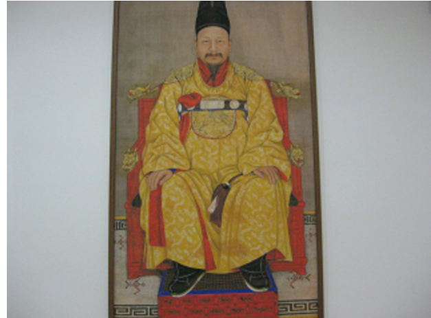
Emperor Kojong refused to sign the 1905 Protectorate Treaty. Photo by the author, August 2010 at Jungmyeongjeon

Deoksugung palace (formerly Gyeongungung): Japan sent its elder statesman, Ito Hirobumi, to conclude the protectorate treaty. On 17 November 1905, Ito entered the palace with an escort of Japanese troops, threatened Emperor Kojong and his ministers, and demanded that they accept the draft Protectorate treaty which Japan had prepared. Photo by the author, August 2010.