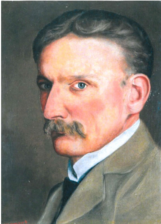
Figure 1: Otto Overbeck, self-portrait (1902).

enterprising Otto Overbeck became interested in the idea of rejuvenation and attempted to capitalise on its popularity by relating the restoration of bodily health and youth to the force of electricity.