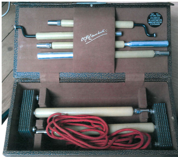
Figure 2: Overbeck's Rejuvenator. This is the original model, produced around 1926, showing the three different pairs of electrodes, including the patented body combs. The large, heavy battery came in a separate case, while the small black plaque on the inside lid displayed details of a British patent and proudly announced that the device was manufactured by the Ediswan Company.

Card', where Overbeck was careful to note that '[t]his treatment is guaranteed absolutely harmless, however often used, when the above directions are followed, and the cure follows with a rapidity accordingly.' 45 Instructions for testing and replacing the battery and cleansing the electrodes were also included, and users were reminded that the electrodes should remain in constant circular motion during treatment. 46 Of course, the best results could only be achieved by using Overbeck's own 'Skin-Rejuvenating Soap' to cleanse the body and hair before commencing treatment, and users were encouraged to 'save [their] . . . skin with the soap of a scientist.' 47 He did not specify the manufacturer of the product, yet the soap was marketed as a worthwhile restorative of a youthful complexion in its own right. It also demonstrated a further level of business acumen associated with the Rejuvenator and enhanced Overbeck's credentials as a scientific authority. Not only were other products recommended to allow the best possible outcome, but replacement batteries should, Overbeck warned, only be sought from his company. 48 He furthered the promise of the Rejuvenator by branding the batteries, manufactured specially by the Ever Ready Company, as 'Life Cells'.