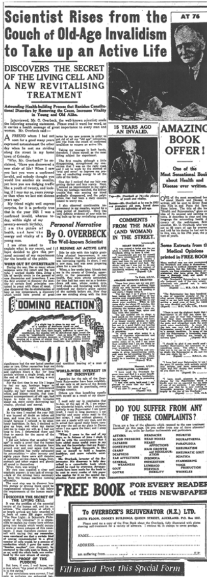
Figure 3: This is just one example of numerous advertisements for the Overbeck Rejuvenator which appeared in the Australian press in the 1930s. It included personal testimony from Otto Overbeck, recommendations from medical men and satisfied users, and a coupon for a copy of Overbeck's explanatory pamphlet.

offices due to overwhelming demand. 60 This was no doubt fuelled, at least in part, by an endorsement from the famed Australian vocal impersonator, Minnie Love, who declared that she used the Rejuvenator in between performances, and vouched for its efficacy in