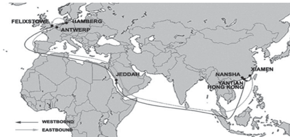
Figure 2. Cooperative service route with a joint fleet of COSCO and HANJIN vessels.

For a round trip, just one ship is used for slot co-allocation. According to alliance agreements and constraints equations (7) and (8) above, in a voyage, the two companies get their own slot space and reefer plugs for their container transport service. For this voyage, the available reserved space for the companies is 2,500 TEUs for COSCO, and 1,500 TEUs for HANJIN, respectively, without considering weight limitations. The maximum available deadweight tonnage for this voyage is 65,500 tons. The number of reefer plugs for COSCO is 300 and for HANJIN 100.