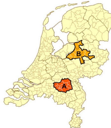
Fig. 1. Region A includes municipalities of Q-HORT participants. Compared to Region A, Region B includes municipalities with low Q fever incidence from 2007 to 2010 but similar SARS-CoV-2 incidence from February to June 2020.

For comparing the SARS-CoV-2 incidence in former Q fever patients we selected Region A, which consists of 12 municipalities in the South of the Netherlands (Noord-Brabant) where most Q-HORT participants lived (Fig. 1). Age-specific SARS-CoV-2 incidences were calculated based on the mandatory case reports