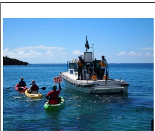
Japan Coast Guard Battles Citizen Demonstrators in Kayaks

Instead of waiting for the outcome of these legal cases, the Japanese government has stooped to new lows in dealing with demonstrators. Last month, with U.S. backing, it created a 2-km exclusion zone in the seas around Henoko and threatened to prosecute anyone entering it under the keitokuhō , a long-mothballed criminal law dating back to 1952 when the Japan-U.S. security treaty first came into existence. In addition, Tokyo ordered the National Police Agency to create a special team to suppress protesters and installed sharp metal grills outside Camp Schwab to prevent sit-down demonstrations from blocking the gates. 15