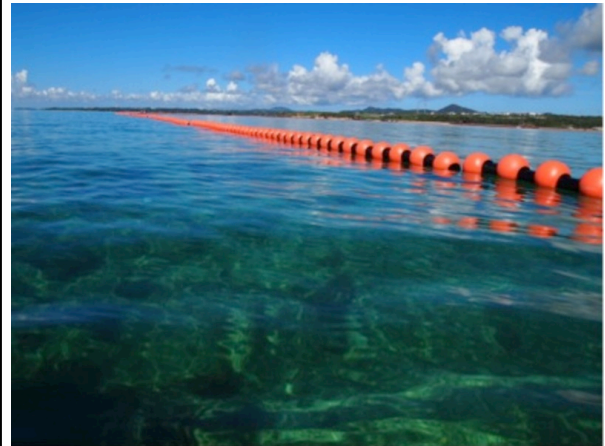
On the edge of the newly-created exclusion zone on Henoko Bay

Take for example, hip-hop artist Kakumakushaka who raps about the U.S. occupation of Okinawa - including Tami no Domino , a blistering track about the 2004 helicopter crash. Then there are the designers for fashion label Habu Box whose t-shirts feature bright hibiscuses flowering from the barrels of G.I. rifles and jackets embroidered with U.S. Ospreys clashing with giant shiisa - the mythical lion-dog that can often be seen guarding Okinawan rooftops.