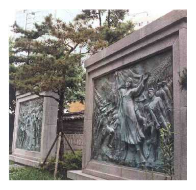
Bronze bas-reliefs commemorate the March 1 reading of the proclamation in Tapgol Park

The 3.1 movement originated at Seoul's Tapgol Park, formerly called Pagoda Park and now regarded as an oasis for senior citizens. Just beyond the gate, a huge stone monument engraved with the Proclamation of Korean Independence stands to the right. At the end of the proclamation appear the names of 33 people with the title "representatives of the people." In reality, however, it was a student who actually read the proclamation before citizens who gathered at the park.