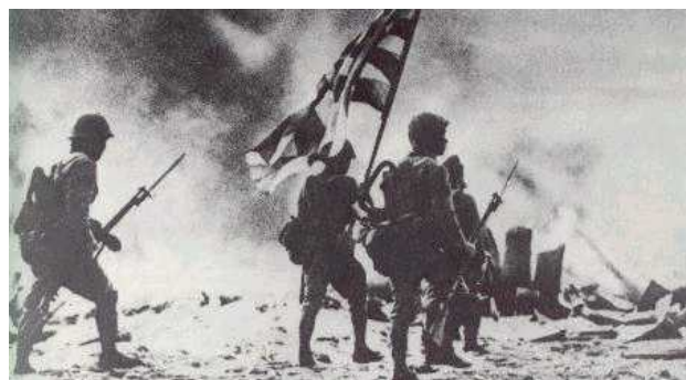
Japanese marine attack Rabaul in 1942.