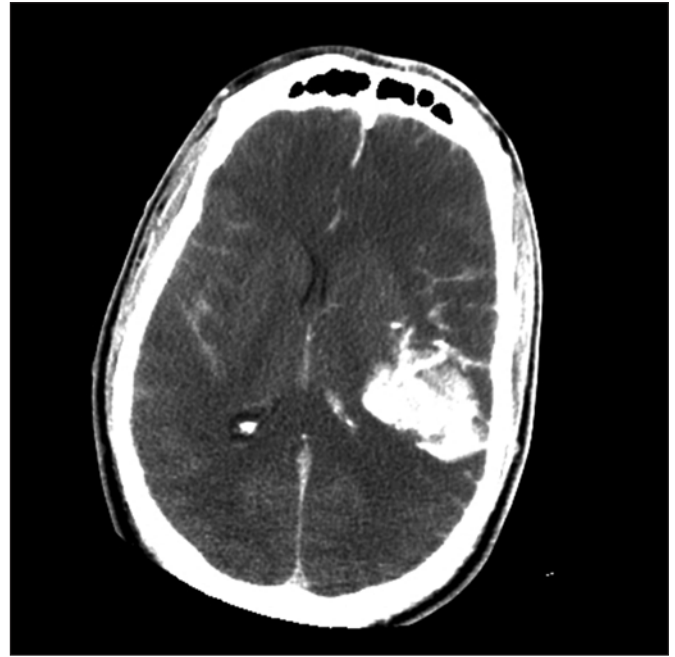
Figure 6: CT head showing deep temporal hemorrhage, along the knife tract but away from the site of the arterial disruption.

The patient was transported to the neuro intensive care unit, where an intraparenchymal monitor was placed, confirming an intracranial pressure (ICP) of 70 cm H 2 O. Despite full medical management, the ICP remained elevated, and active treatment was withdrawn 12 hours following the endovascular intervention. The patient died shortly thereafter. Unfortunately, the family declined autopsy.