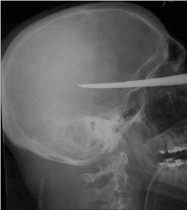
Figure 1: Lateral skull xray showing depth of penetration of knife blade.

along the sphenoid sinus, extending into the left temporal and parietal lobes, with associated subarachnoid blood. There was no associated epidural or subdural hematoma. Any inadvertent movement of the knife was considered to represent a threat to the