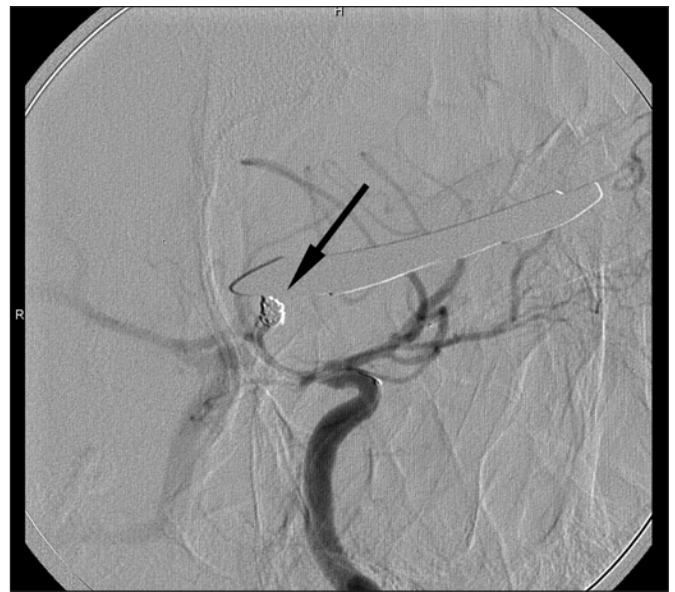
Figure 3: Oblique projection of left internal carotid injection following deposition of three embolic coils in the arterial stump.

A cerebral angiogram was performed on the suspicion of injury to the vascular tree. The operating room was placed on standby. Angiography revealed the knife in close proximity to the left A2 segment of the anterior cerebral artery, which was occluded distally, leaving a 3 mm stump of the A2 arterial segment (Figure 2). The precariously positioned knife would have made performing a craniotomy dangerous and difficult, so the decision was made to proceed with endovascular treatment. A 45 degree angled Excelsior SL-10 microcatheter (Boston Scientific, Fremont, CA) was navigated into the stump over a