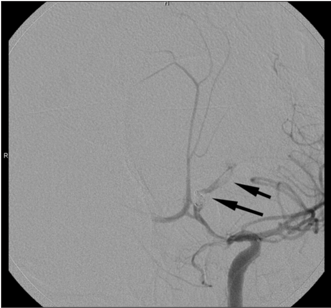
Figure 4: Oblique projection of left internal carotid injection demonstrating contrast extravasation following removal of the knife.

deployed, and the extravasation stopped (Figure 5). An immediate follow-up CT scan was performed following embolization, which demonstrated a deep left temporal intracerebral hemorrhage separate from the site of the anterior cerebral artery injury (Figure 6), likely from small vessels along the knife blade tract.