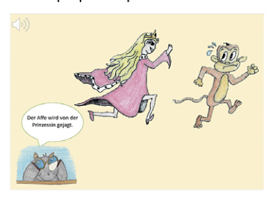
der Affe wird von der Prinzessin gejagt "the monkey is chased by the princess"