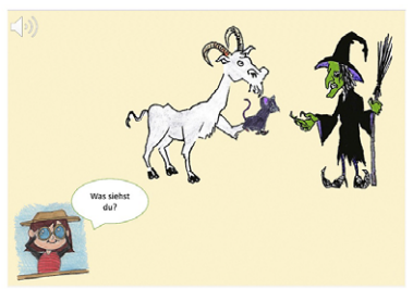
die Ziege gibt die Maus zu der Hexe "the goat is giving the mouse to the witch"