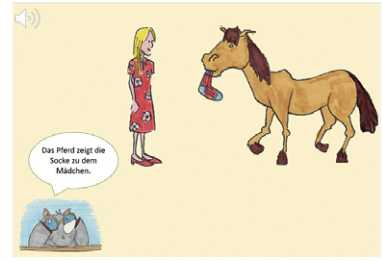
das Pferd zeigt die Socke zu dem Mädchen "the horse is showing the sock to the girl"