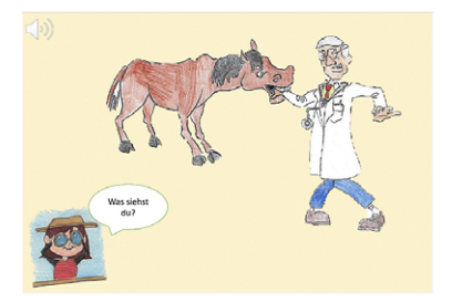
der Arzt wird von dem Pferd gebissen "the doctor is bitten by the horse"