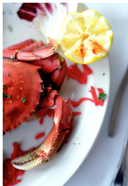
San Francisco is known for its fine dining and diverse culture.

APSA provides travel grants to assist some members in attending the Annual Meeting. APSA members who are US graduate students, international graduate students studying in the United States, unemployed, or international scholars are eligible to apply. If selected, recipients must preregister for the APSA Annual Meeting in order to be able to receive travel grants. Priority will be given to applicants who will present at the Annual Meeting, to first-time applicants, or those who have not received a travel grant since 2014. For more information visit: http://community.apsanet.org/annualmeeting/register/travel-grants . ■