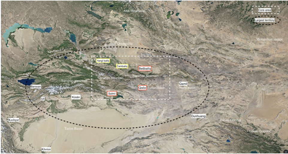
Figure 1. The geographical setting of the West Uighur Kingdom.