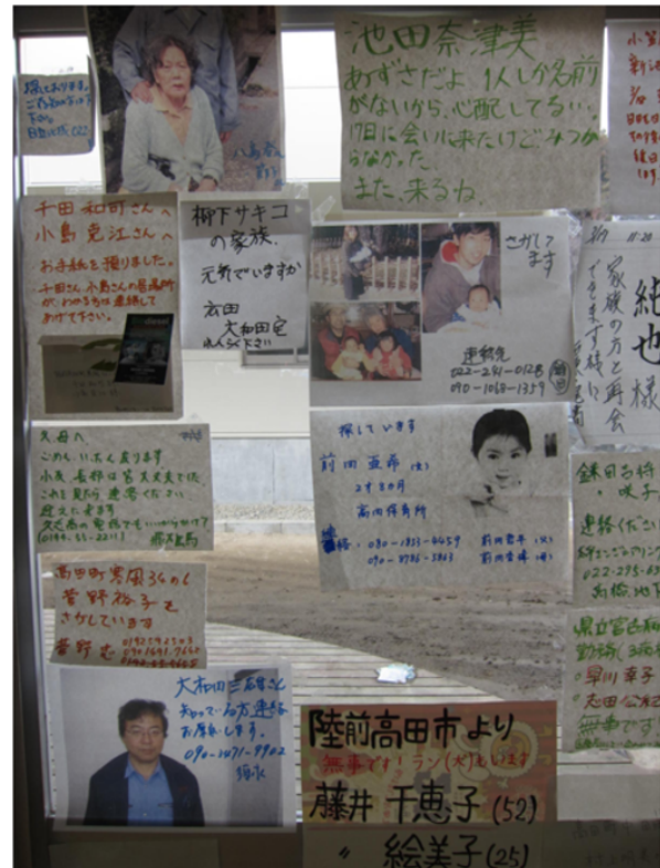
Missing person's wall in refugee center, Rikuzen-Takata