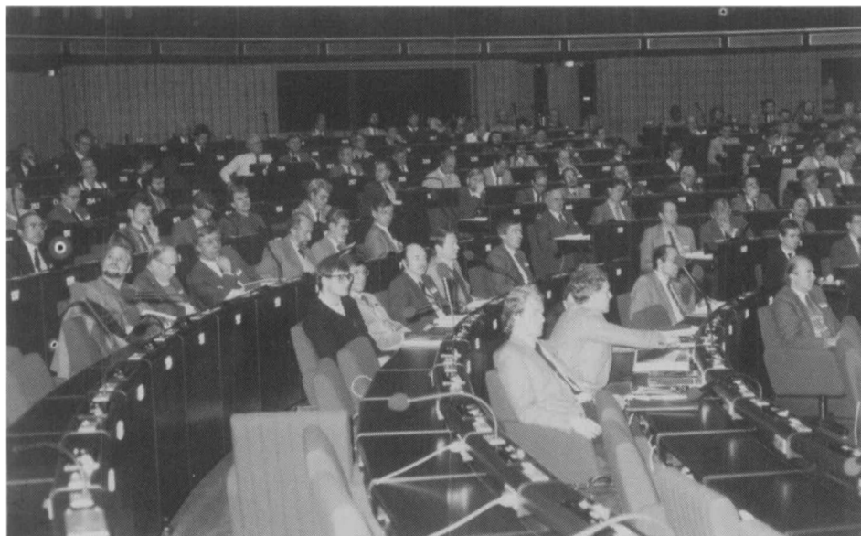
Large audience attends 1985 E-MRS Fall Meeting in Strasbourg, November 1985.