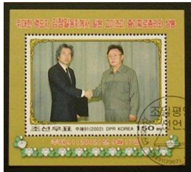
North Korean Stamp to Commemorate the Koizumi Visit

At Pyongyang, the two leaders agreed to "make every possible effort for an early normalization of relations." Koizumi expressed "deep remorse and heartfelt apology" for "the tremendous damage and suffering" inflicted on the people of Korea during the colonial era, while Kim Jong Il apologized for the abductions of 13 Japanese and for the dispatch of spy ships in Japanese waters. North Koreans informed Japan that 8 of 13 were dead and 5 survived.