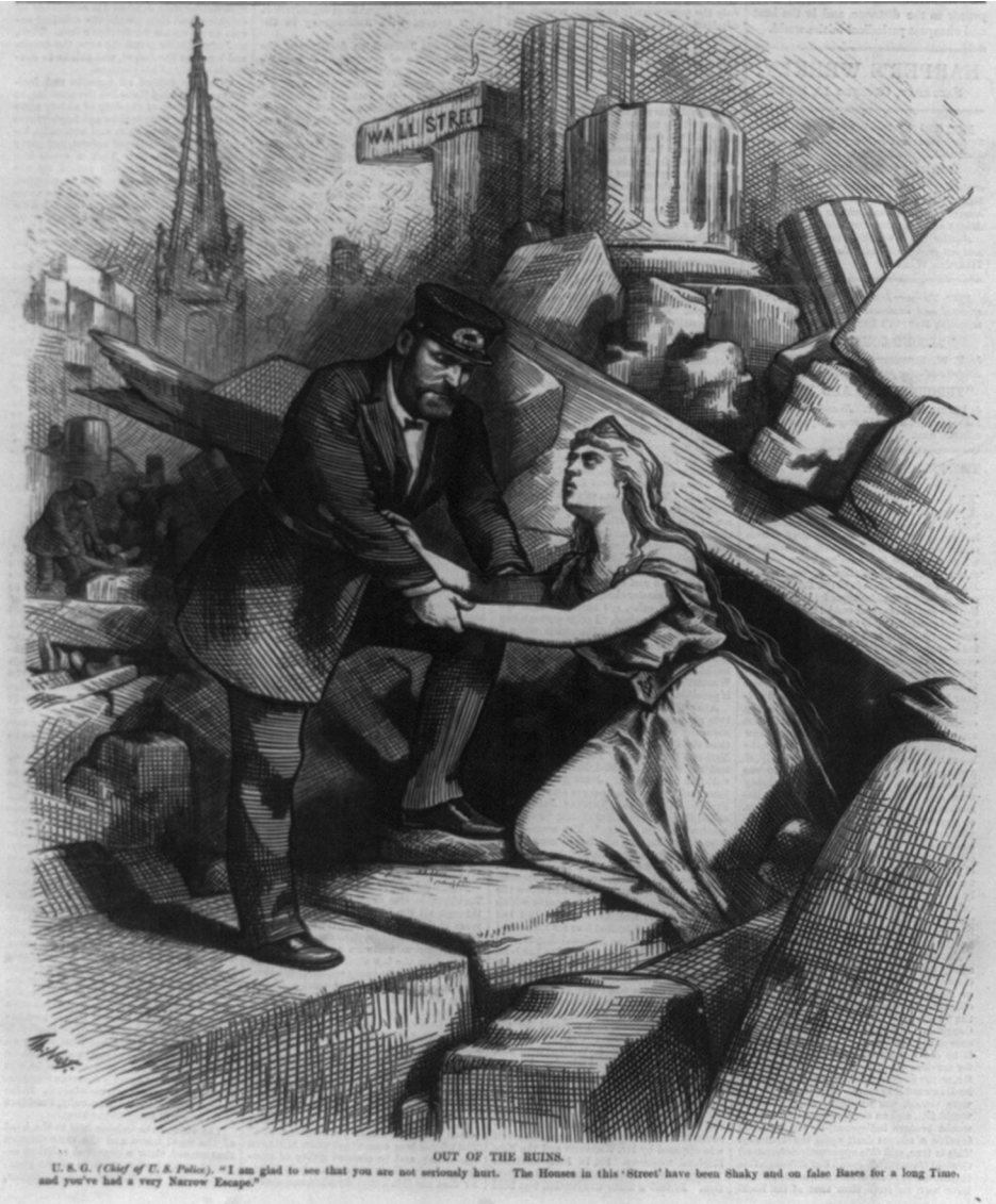
OUT OF THE RUINS. U. S. G. (Chief of U. S. Police). "I am glad to see that you are not seriously hurt. The Houses in this 'Street' have been Shaky and on false Bases for a long Time, and you've had a very Narrow Escape."

Cambridge Core For further information about this journal please go to the journal website at: cambridge.org/jga