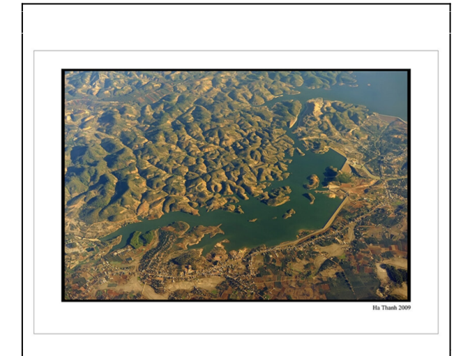
Aerial photo of Da Nhim dam (Lam Dong province)

A1838 759/3/2 Part I, Japan-Economic Relations with Vietnam "Reparation Agreement with Vietnam," Australian Embassy, Saigon, 18 May 1959).