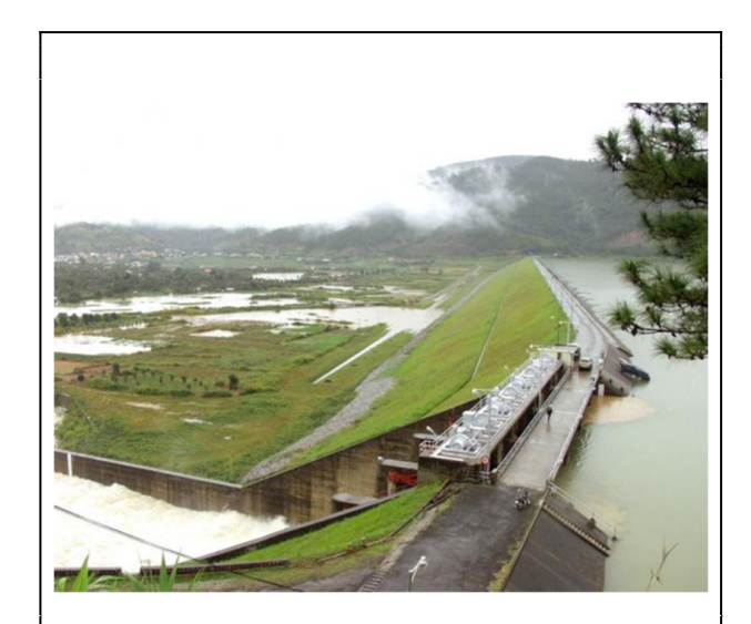
Da Nhim flood control gate

it was also specified that all services supplied would be by Japanese nationals or groups (See this link). This was a propitious start to what would emerge as a prestigious project, one that still plays a part in hydraulic control of the Da Nhim Valley.<sup>3</sup>