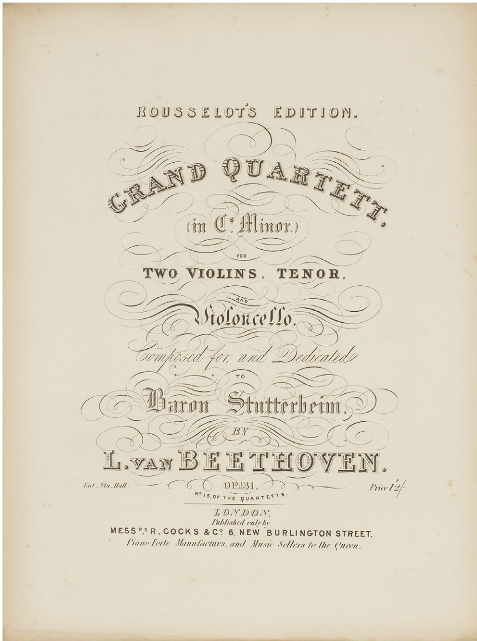
Figure 1. Beethoven, String Quartet in C \sharp minor, op. 131 (Violin I), Rousselet's edition, title page. The Bodleian Libraries, University of Oxford, Mus. 177 c. 137 (15).

'an undertaking far surpassing in difficulty any of a similar kind which have been attempted in this country', Cocks's 'Notice' offered thanks to the Council of the Beethoven Society and above all to Alsager 'for the loan of his corrected copies of the scores and separate parts of those unrivalled compositions, which had previously been