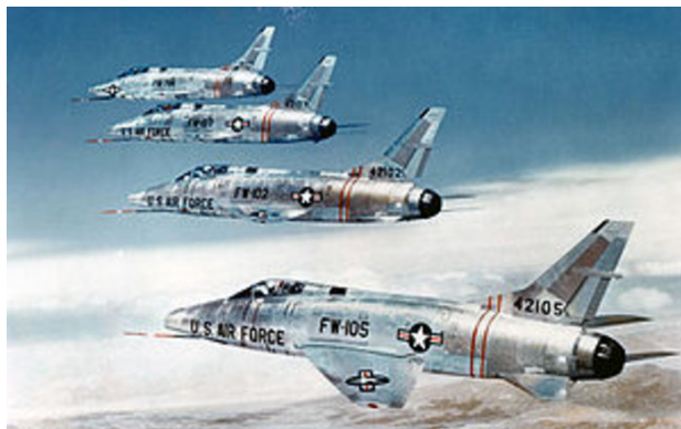
F-100s in formation

But I knew what it dealt with was all too real. I had seen some of the smaller bombs myself, H-bombs with an explosive yield of 1.1 megatons each—equivalent to 1.1 million tons of high explosive, each bomb half the total explosive power of all the bombs of World War II combined. I saw them slung under single-pilot F-100 fighter-bombers on alert at Kadena Air Base on Okinawa, ready to take off on 10 minutes' notice. On one occasion I had laid my hand on one of these, not yet loaded on a plane. On a cool day, the smooth metallic surface of the bomb was warm from the radiation within: a bodylike warmth.