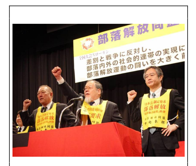
Members of the Buraku Liberation League at the group's national assembly in Tokyo (2015).

liberation and becoming "regular Japanese", has been a prominent issue in debate between especially, but not only, people associated with the BLL and Zenkairen (now Jinkenren). The BLL side has tended to take the former position, and the Zenkairen-affiliated side has tended to take the latter.<sup>60</sup>