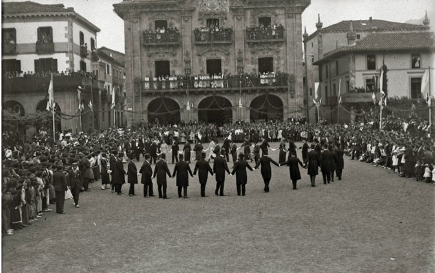
Figure 1. Celebration of the International Congress on Basque Studies by the Basque Studies Society in Oñati, Gipuzkoa, February 11, 2017.