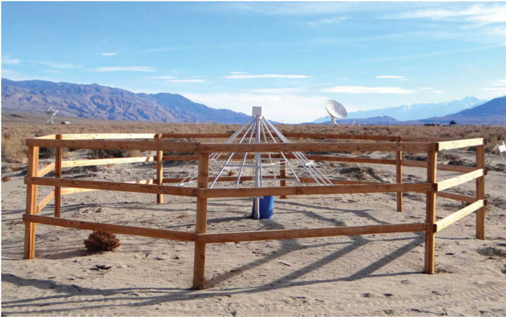
Figure 1. One of the LEDA outrigger antenna stands equipped for global 21-cm observations and located at the Owens Valley Radio Observatory (from Price et al. , 2017).