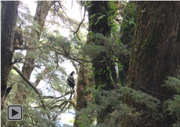
PLATE 1 Mother and infant of Rhinopithecus strykeri in the newly discovered population in Luoma, China, near the border with Myanmar (Fig. 1).

outside the Reserve, close to Chengan township, where they may occasionally be hunted by the Lisu people (Ma et al., 2014). The border of the reserve may therefore need to be adjusted to ensure the full protection of the population. We aim to conduct further research and to develop a conservation action plan to protect nearby forests, which also harbour other threatened species, such as the Endangered red panda Ailurus fulgens styani , Vulnerable Mishmi takin Budorcas taxicolor taxicolor , and Vulnerable Sclater's monal Lophophorus sclateri . In addition, further surveys to locate other potential R. strykeri populations and to determine accurately the population size in the Sino-Myanmar region are required for a full assessment of the conservation status and needs of this Critically Endangered primate.