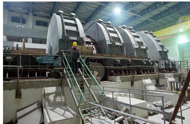
The Bushehr nuclear power plant