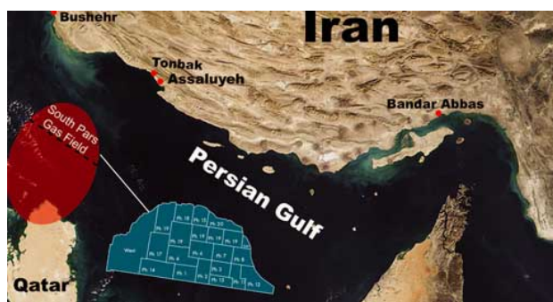
The South Pars Field

Russia's number one priority in energy cooperation with Iran will be for upstream participation by Russian companies. Gazprom has had some limited participation so far in the early phases of Iran's massive South Pars gas fields with an estimated aggregate cumulative production range of a stunning 13 trillion cubic meters. Moscow will be keen to promote greater involvement. Gazprom has shown interest in the Iran-Pakistan-India pipeline project not only as a contractor but also as an investor.