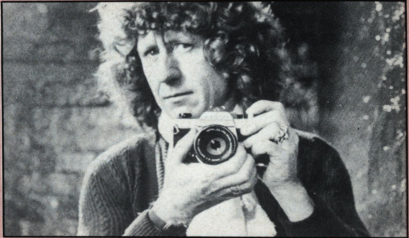
Top fashion and advertising photographer Peter Gough, reflecting on the new Pentax K1000.