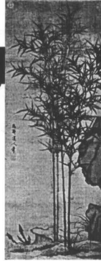
Art from The Arts of China