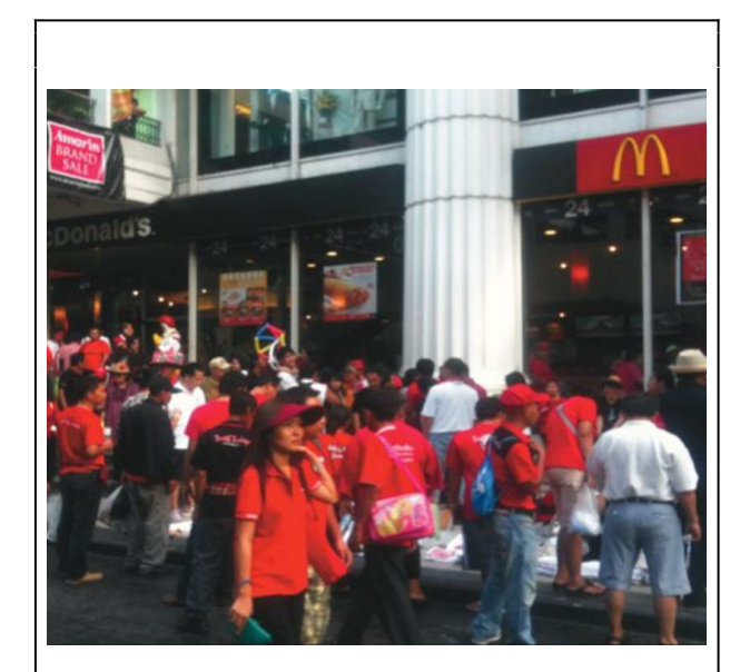
Red shirts gather under the yellow arches

Nation, Religion and King, a trinity traditionally lauded as pillars of Thai society, had been elevated to a quasi-spiritual level during the war against communism, as if the epitome of a singularly Thai essence. Yellow shirt manipulation of this trope becomes all the more clear when put side by side with red. Ever since the rise of the Soviet Union and People's China, along with satellite regimes in Vietnam and Cambodia, red has been all but synonymous with communism. Prince Sihanouk famously described the Pol Pot group as the "Red Khmer," or Khmer Rouge, and the name stuck. Elsewhere, red flags, red stars and red headbands endowed the wearer with powerful associations, even to the point of intimidation, with revolutionary communism.