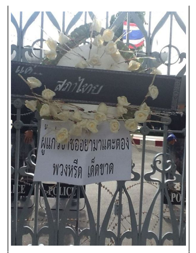
Symbolic wreath on Thai Parliament gate adjacent to yellow shirt gathering

The speeches were peppered with the same kind of crowd-pleasing juicy hot stuff one hears at red rallies, full of bombast and hyperbole, but the crowd itself struck me as being considerably more relaxed, united and sure of itself than the red shirts were the other day. Maybe it's the difference of commuting from the suburbs instead of the countryside. Maybe it's the difference of sitting near a verdant zoo where public bathrooms are available compared with sitting in a naked intersection with no street level amenities other than an overwhelmed McDonalds. In any case, the yellow shirt gathering was more subdued in tone, in all senses of the word, than the last edgy red massing at Ratchaprasong.