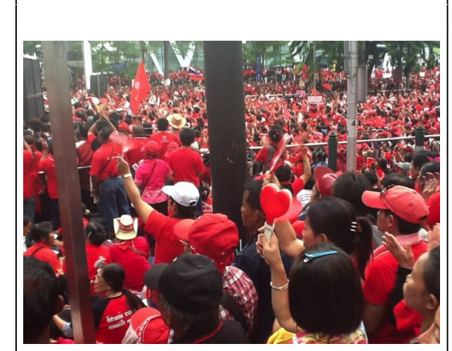
The red shirts awaiting arrival of red celebrity Jatuporn Phrompong

whom a possible accommodation is in the works.