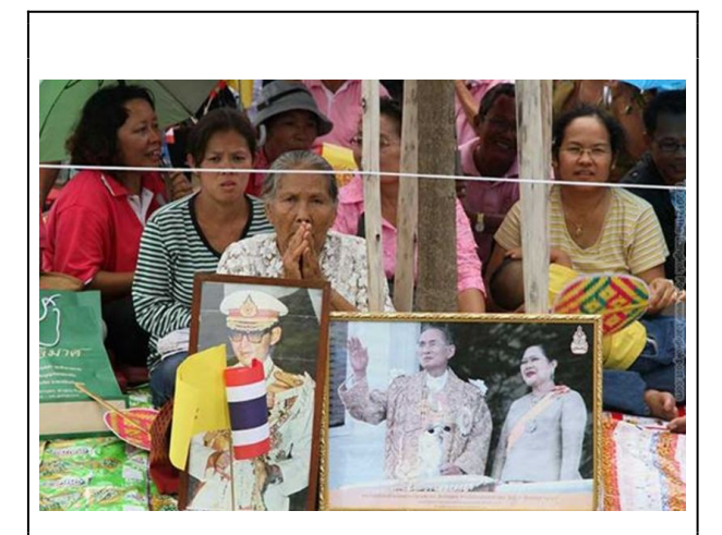
Bangkok Post photo of citizens in Ayutthaya for May 4, 2012 royal visit

It is significant that the ceremony at Thung Makham Yong attracted Thais of different stripes and from all walks of life, rural and urban, north and south, red and yellow, civilian and military, capitalists and formerly communist-leaning activists. It harks back to the unifying role the monarchy has played at certain divisive junctures in the past, particularly in October 1973 and in May 1992.