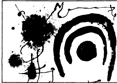
Joan Miró's Flora I , original lithograph. Signed edition of 50.