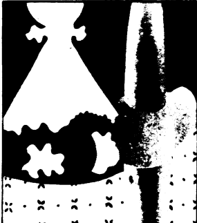
Thom de Jong's French Dinner , original etching. Signed edition of 175.