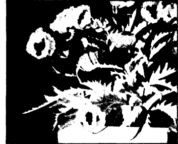
Tjelda Michas' Oriental Poppy , original serigraph. Signed edition of 225.