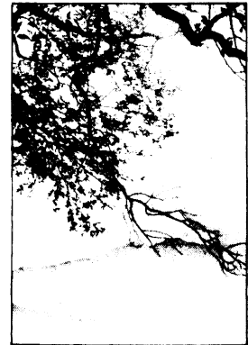
Franklin S. Galambos' Sunward , original hand-colored etching. Signed edition of 265.

You'll find out about the special pleasure of owning original art, instead of just visiting it.