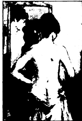
Jan de Ruth's Reflections , original serigraph. Signed edition of 200.