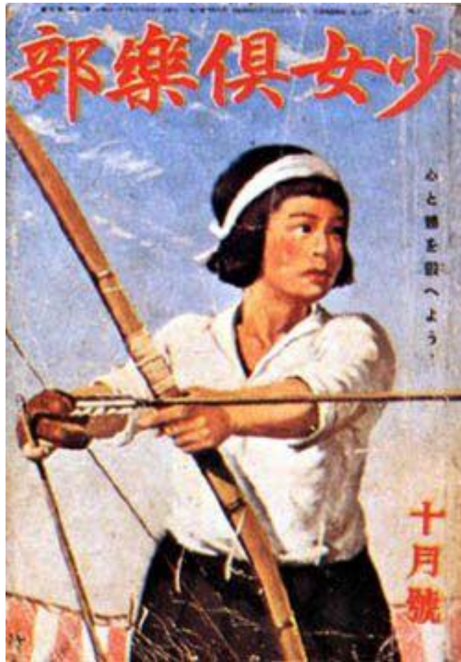
Shojo Kurabu (Girls' Club)