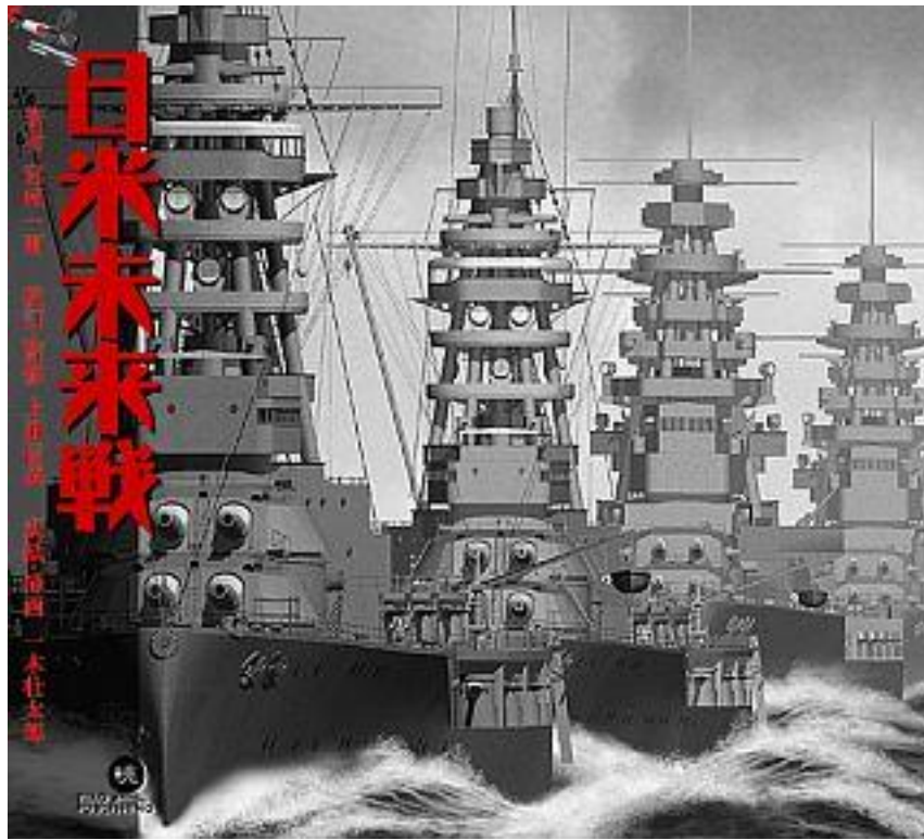
Nichibei miraisen , republished with new artworks in 2006 in an electronic format

Precise circulation figures are difficult to determine for most children's media, but Nichibei reached hundreds of thousands of children through sales of the book and the magazines alone. By 1925, Kodansha claimed to be printing 400,000 copies of Shonen kurabu monthly, selling about 275,000. 16 Its audience was boys aged 8-16, but editors always encouraged girls to read the stories, even after Kodansha started Shojo kurabu ( Girl's Club ) in January 1923. 17 Through the more informal methods of lending, borrowing, or trading, circulation for Nichibei was likely much higher. 18 It became so popular that Kodansha reissued it as a single novel in August 1923 with full-page ads in both magazines announcing its impending publication. 19 The full-page advertisement in the June 1923 issue of Shojo kurabu carried large white characters reverse printed on an exploding black ball: "GREAT HOT-BLOODED NOVEL." To the left another headline read: "Those who love the homeland must buy this!! The great struggle of hot-blooded youth!" 20 The book solidified Miyazaki's reputation as the premier writer of "hot-blooded novels" and helped make Kodansha the leading publisher of children's fiction in the prewar years with Shonen kurabu and Shojo kurabu leading the way. 21 Indeed, Miyazaki held a virtual monopoly over the "hot-blooded" label with both Kodansha and Hakubunkan until his mysterious death in 1934. 22