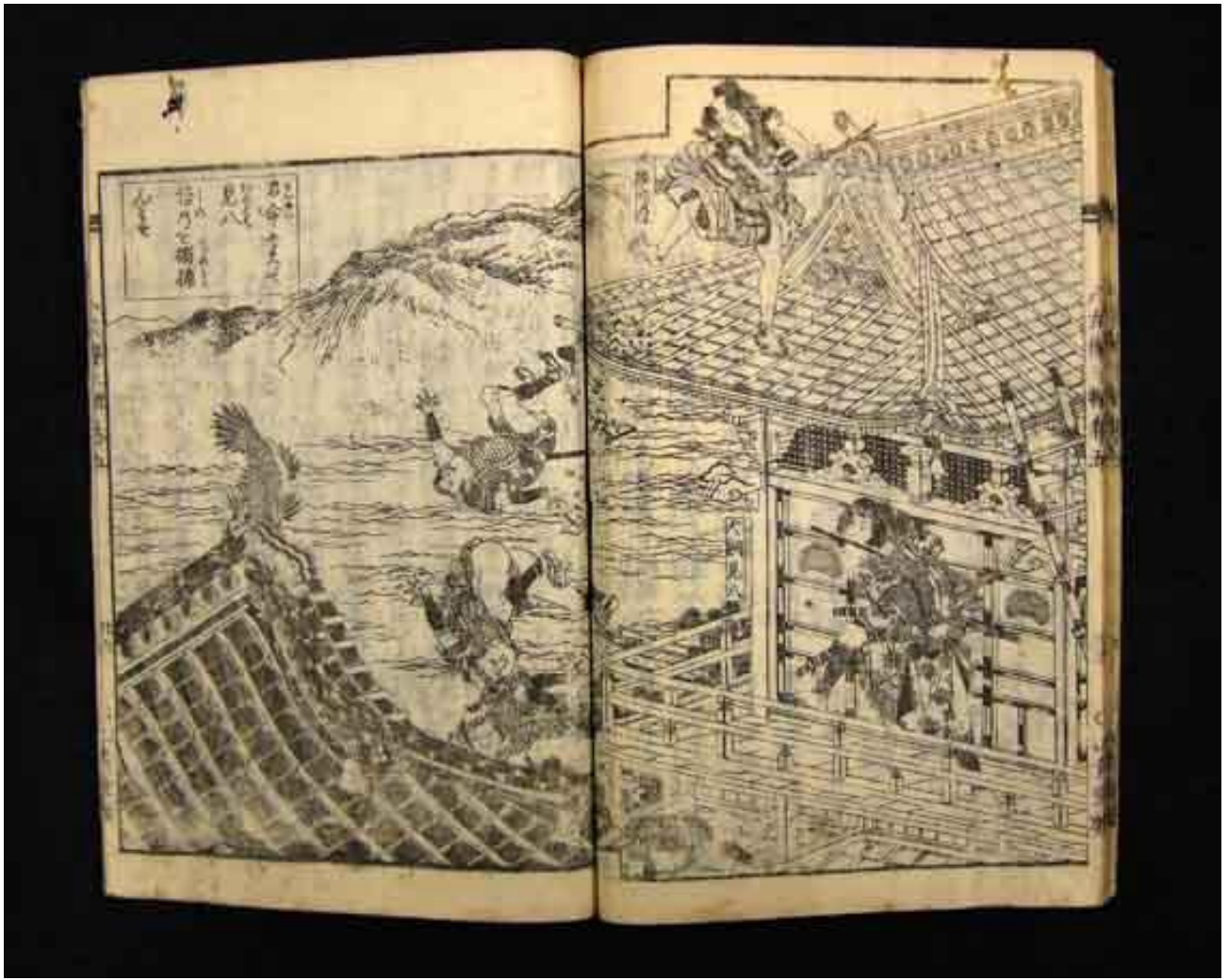
Nanso Satomi Hakkenden, the original first print

In its modern incarnation, the martial imperative first intersected with the moral imperative of kanzen choaku with the outbreak of the Sino-Japanese War in 1894. From its inaugural issue on January 1, 1895 until war's end, Iwaya's Shonen sekai carried a variety of stories of the war in each monthly issue, including reports from the front, accounts of bravery in battle, and tales drawn from Japan's martial past. On the cover of the first issue were two illustrations: one of Crown Prince Munehito (later the Taisho Emperor); the other of the mythical Empress Jingu subjugating Sankan (the three kingdoms of ancient Korea). Inside were stories of Jingu's glorious conquest and of Toyotomi Hideyoshi's invasion of Korea in the 1590s.[50] No mention was made of Jingu's questionable historical status or of the ultimate failure of Hideyoshi's invasion, the final act of which he did not live to see. Jingu was given equivalent historical status with Hideyoshi and their noble acts established a direct link between past and present, legitimizing and justifying the equally noble efforts of Japan's Imperial forces. It is here that Hobsbawm's concept of "invented traditions" becomes an important tool in understanding the process of Japanese militarization. The actual existence of these past heroes and whether they