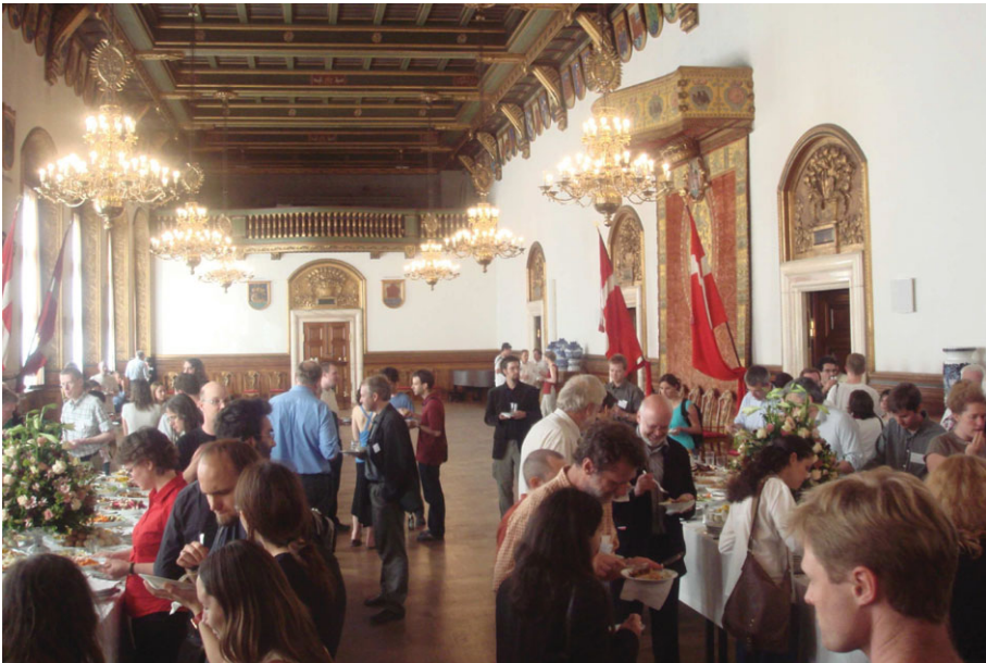
Participants enjoying the reception at Copenhagen Town Hall.