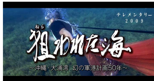
Title page on the documentary website ( http://www.qab.co.jp/nerawaretaumi/ ) The Targeted Sea – A 50-Year Unrealized Plan for a Military Port in Oura Bay, Okinawa

Gishitomi has never known an Okinawa without bases.