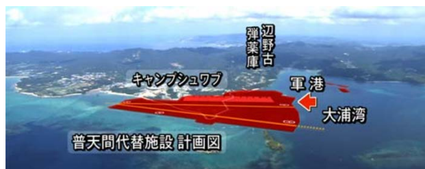
“Futenma Relocation” Plan

loaded directly onto ships from the Henoko Ammunition Depot.