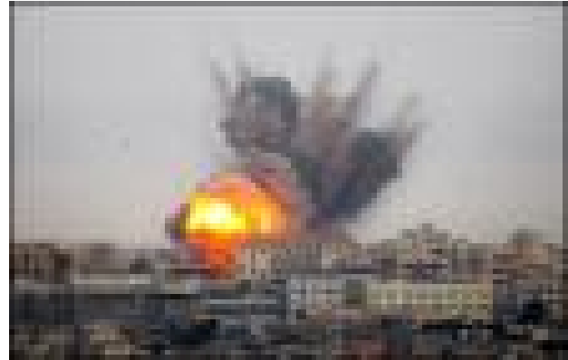
Israeli missiles target Beirut

soon likely to be in Palestinian hands as well. At least 20 of the tanks were seriously damaged or destroyed.