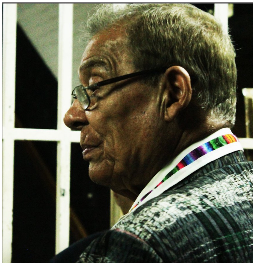
Figure 2: Retired general and former chief of the Guatemalan Army Benedicto Lucas García at the Molina Theissen trial.

guerrillas on the battlefield, he insisted that he did not emit orders—he only received them from the Minister of Defense—nor did he have command responsibility over troops.