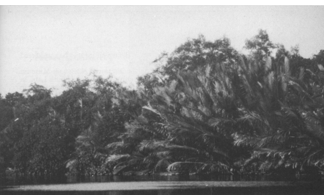
MANGROVES and NIPA PALMS (right)

Red Data Book and on Appendix I of both the Convention on International Trade in Endangered Species (CITES) and the US Endangered Species List. J.A. Kern, who studied them in the Brunei Bay area, found them to be still thriving, unaffected by the regular boat traffic or the close proximity of man, 1, 2, 3 and the author found the same in 1979. Indeed, one large group was seen within 100 metres of a small mainland village, and local people showed no interest in hunting or otherwise disturbing them. Proboscis also have potential as a tourist attraction, since they can easily be seen in early morning or late afternoon only 15 minutes by boat from the centre of Bandar Seri Begawan.