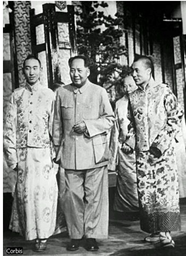
Dalai Lama (r.) and Panchen Lama flank Mao Zedong in Beijing, 1959

Beijing’s “Dalai line” collapsed after the Lhasa incident of March 1959. But the seeds of change were sown throughout the 1950s. The delicate inter-ethnic collaboration in Tibet was then replaced by intense class struggles. Although the status quo of Tibet proper was temporarily maintained, in the mid-1950s the CCP began pushing reforms in the Tibetan areas of Qinghai, Xikang, and Sichuan (Amdo and Kham to the Tibetans). These reforms provoked local resistance. In the face of PLA attack, members of the resistance movement retreated into Tibet. The spillover seriously undermined the fragile political balance in Tibet, and eventually contributed to the Lhasa incident of March 1959. Melvyn Goldstein’s research further reveals that the extremist tendencies of the hardliners within the Lhasa regime and among CCP officials in Tibet eliminated any chance for a stable compromise between Beijing and Lhasa.[19]