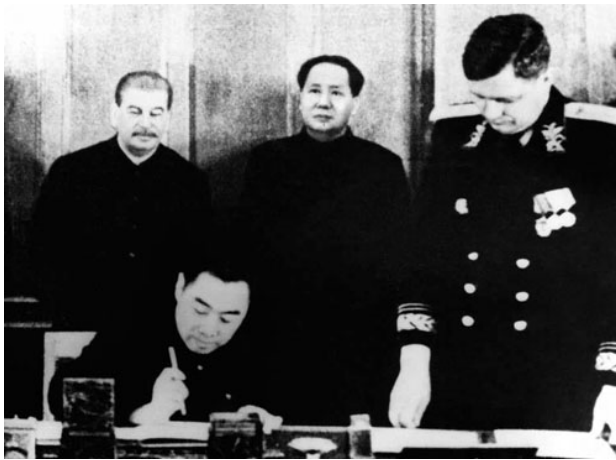
Zhou Enlai signing the Sino-Soviet Treaty in Moscow

Mongolia, and Russia, its 1950 settlement was a far cry from the principle of national self-determination that all these revolutions claimed to support. Mongolia's ethnonationalist revolution never managed to break its international and inter-ethnic restraints. During the twentieth century, the powerful forces surrounding and intervening in Mongolia—China, Russia and Japan—were alternately hostile and conciliatory toward each other, while constantly keeping Mongolia divided. This was the case even when Mao Zedong and Joseph Stalin forged their “Communist monolith” over the Eurasian landmass. Under the circumstances, the independent Mongolian state could be easily viewed as a geopolitical creation of others' schemes but not a dynamic national entity of its own devices, above all in light of the large Mongol population living across the border in Inner Mongolia.