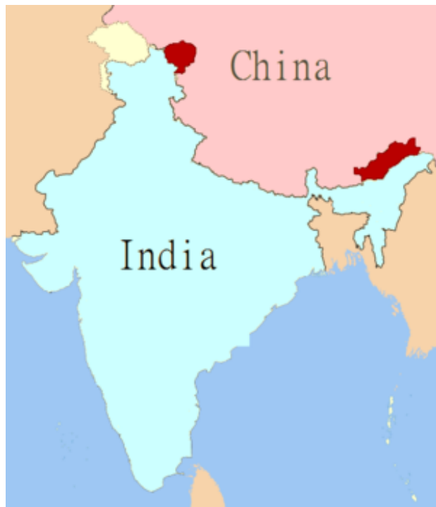
Map shows disputed territories in red at the

African countries. After the Tibetan rebellion, the Dalai Lama escaped to India and issued a statement against the PRC. In response Mao suggested that the Chinese media carry out sharp criticism of Nehru. There was no need to fear upsetting him or falling out with him. The struggle against Nehru was to be carried forward in order to achieve unity with him. Such a seemingly self-contradictory “struggle philosophy” had an inner logic, pivoting on the relationship between “part” (jubu) and “whole” (quanju). In May 1959, Mao deployed such logic in finalizing an important letter from the Chinese Ministry of Foreign Affairs to the Indian government. In the letter, Mao sought to explain to the Indian government that the Sino-Indian disagreement over Tibet involved China’s internal affairs and sovereignty. These were “issues of principle” over which China could not make concessions. Yet Mao also appeared conciliatory in suggesting that this disagreement only involved a “temporary” and “partial” problem and should not damage the two nations’ overall cooperation in international affairs.[27]