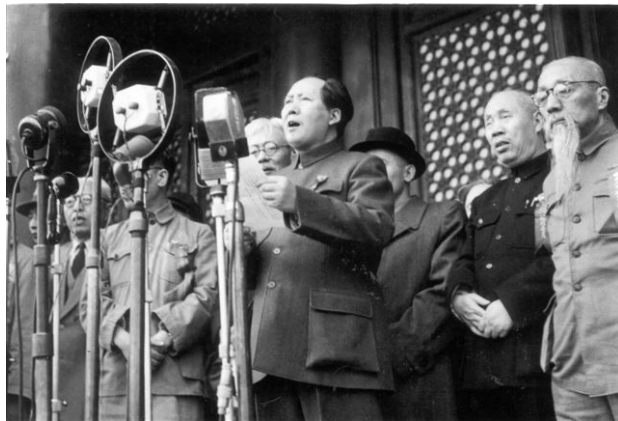
Mao and Chinese leaders at Tiananmen, October 1, 1949

Union. During the Chinese Civil War and the early Cold War years, however, leftist Inner Mongol autonomists were so deeply engulfed by Moscow-Yan'an-Ulaanbaatar bloc politics that they could not prevent the CCP's class-based "national liberation" from trumping their ethnonationalist movement. However reluctant, MPR leaders and most Inner Mongol autonomists had to accept the establishment of the PRC as the consummation of Inner Mongols' "national liberation" as well. Consequently, October 1 of 1949 marked the end of "national-liberation" history for both the Chinese and the Mongols.