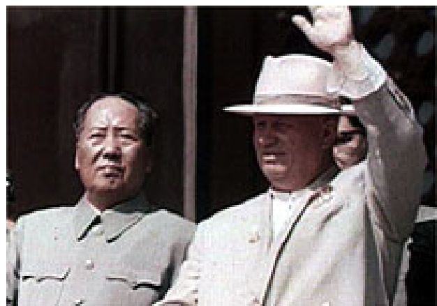
Mao and Khrushchev in Beijing

arguments over the recent Taiwan Strait crisis and the Sino-Indian conflict. The Soviet side accused Beijing of taking a bellicose stand over the Taiwan question and risking the provoking an unnecessary war with the United States. In addition, the Soviets suggested that Beijing made serious mistakes in postponing reforms in Tibet and failing to intercept Dalai's flight into exile. They also blamed Beijing for provoking the Sino-Indian conflict, contending that the CCP's India policy created opportunities for American imperialism. Not surprisingly, Mao and his associates refused to accept any of these criticisms, reciprocating the Soviets by labeling their attitude as opportunism. The Chinese side stressed that both Taiwan and Tibet were China's internal affairs and China could not possibly retreat from its principled stand. CCP leaders wondered why, as a "big brother," the Soviet Union should make no distinction between right and wrong and take the side of bourgeois India in the Sino-Indian conflict. During the talks Khrushchev raised the issue of "the Soviet Union as the head of the socialist camp." This was intended to explain why the Soviets "said things ordinary guests would not have said," meaning that the Soviet side criticized Beijing in the "big brother" capacity and on the basis of "communist principled stand." [30]