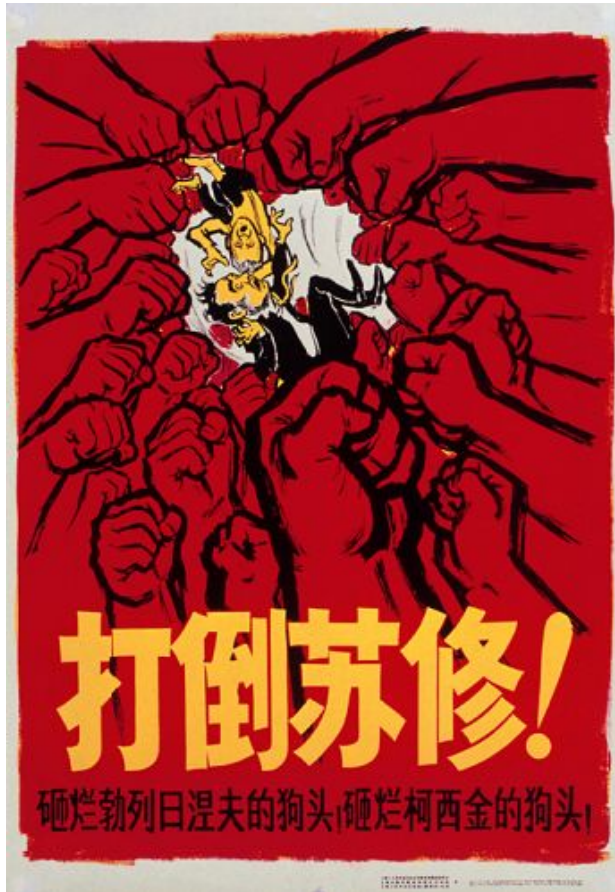
1967 Chinese poster: Down with the Soviet Revisionists!

that they are now engaged in their own “cold war.” . . . The present rupture signifies that Communist ideology has not only failed to overcome nationalism within the bloc, but has indeed aggravated such sentiment.[36]