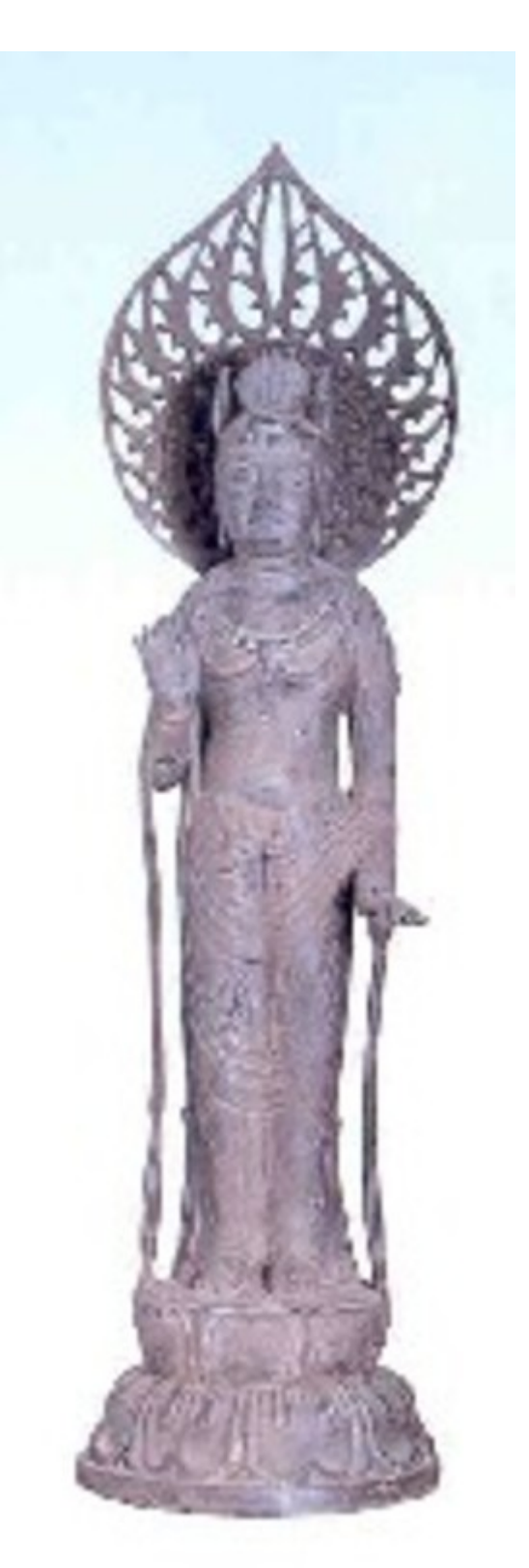
Chiran Kannon temple Chiran Kannon statue