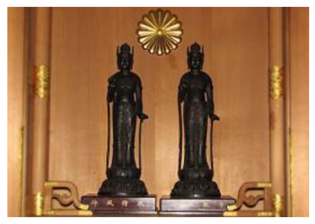
Setagaya Tokkō Kannon-dō Two Setagaya Kannon statues