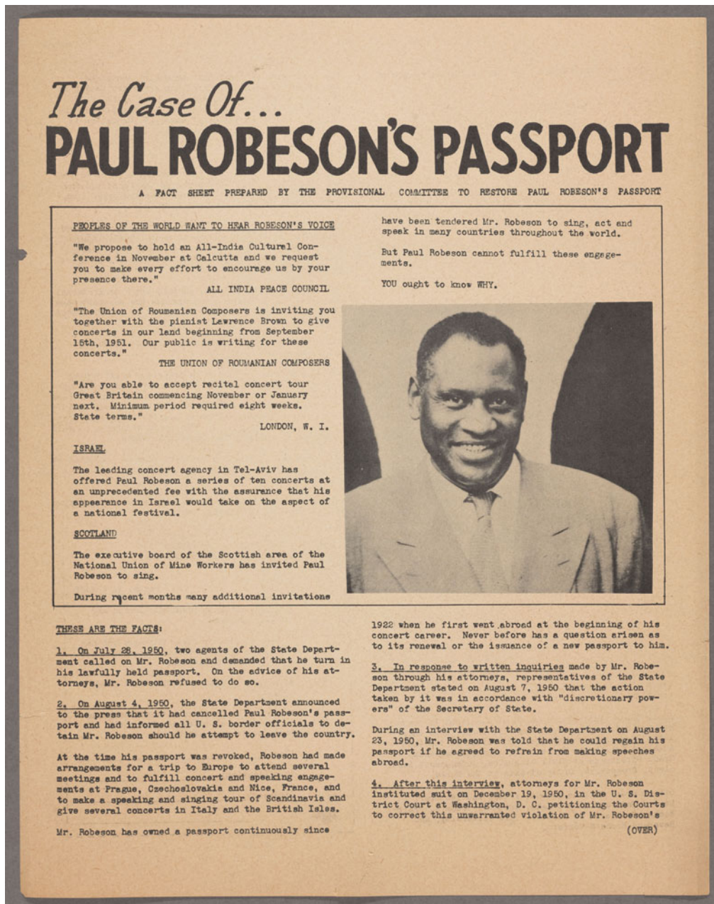
Figure 1. Pamphlet, "The Case of Paul Robeson's Passport." 87

an American, as a man!" 88 Robeson maintained that it was his patriotic duty to challenge injustice wherever it is found. 89 He argued that the rights enshrined in the First Amendment should not disappear when a citizen engages with political issues beyond the borders of the