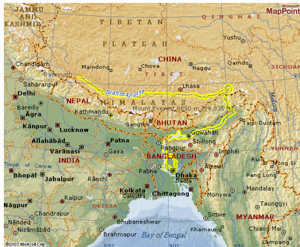
Yarlong-Tsangpo/ Brahmaputra River in Tibet and South Asia

damagingly accelerated by global warming.