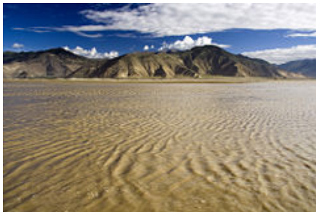
The Yarlong Tsangpo River in Tibet

While intrastate water-sharing disputes have become rife in several Asian countries — from India and Pakistan to Southeast Asia and China — it is the potential interstate conflict over river-water resources that should be of greater concern. This concern arises from Chinese attempts to dam or redirect the southward flow of river waters from the Tibetan plateau, where major rivers originate, including the Indus, the Mekong, the Yangtze, the Yellow, the Salween, the Brahmaputra, the Karnali and the Sutlej. Among Asia's mighty rivers, only the Ganges starts from the Indian side of the Himalayas.