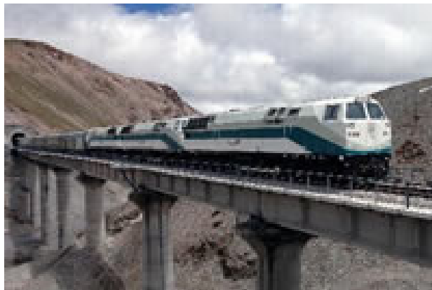
The Qinghai Tibet Railway

Contrast China's reluctance to establish a mechanism intended for mere "interaction and cooperation" on hydrological data with New Delhi's consideration toward downstream Pakistan, reflected both in the 1960 Indus Waters Treaty (which reserves 56 percent of the catchment flow for Pakistan) and the more recent acceptance of World Bank arbitration over the Baglihar Dam project in Indian Kashmir.