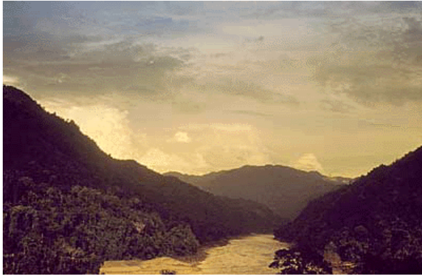
The Brahmaputra River

The 10 major watersheds formed by the Himalayas and Tibetan highlands spread out river waters far and wide in Asia. Control over the 2.5 million-square-km Tibetan plateau gives China tremendous leverage, besides access to vast natural resources. Having extensively contaminated its own major rivers through unbridled industrialization, China now threatens the ecological viability of river systems tied to South and Southeast Asia in its bid to meet its thirst for water and energy.