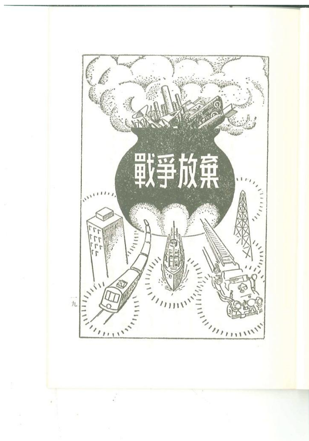
From tanks and bombs to trains and buildings