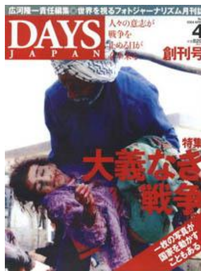
The cover of DAYS Japan , inaugural issue (April 4, 2004).

Your Honors, can you not hear them: the voices of pain and sadness coming from the Iraqi people, and the footsteps of war that are approaching Japan? The plaintiffs and the attorney before you can hear them clearly. We have brought this lawsuit with the urgent desire of stopping this development. It is truly a shame that the court has not admitted the testimony of witnesses and Plaintiffs, but the Plaintiffs have submitted extensive documentary evidence. We ask that the court read all the documentary evidence and take the time to confront, in silence, this photograph of a bloodstained girl. And please do not hand down a decision along the lines of the Kofu District Court decision, as argued by the State. That self-abnegating decision might as well be deemed a suicidal action the part of the Court.