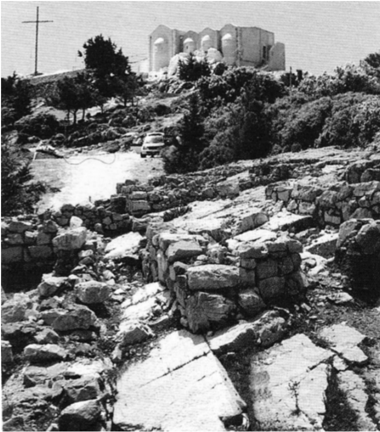
8.8. The remains of a temple or shrine structure in the foreground at the important Minoan peak sanctuary of Youchtas. The largest religious feast of the year still takes place at this site, although the rituals are now held in the church in the background.

gathered to enhance social solidarity and stability (Borgna 2004:137). Although solidarity within the group hosting these feasts may have been enhanced, the underlying motive of the organizers was more likely to have been the promotion of individual or possibly corporate benefits and political control, as discussed previously.