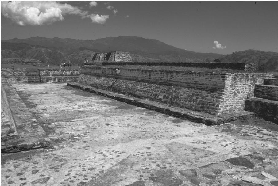
8.11. Ball courts such as this example at Mixco Viejo (Guatemala) were important feasting sites in Mesoamerica. They combined sports, betting, ostentatious displays of wealth, and sometimes human sacrifices in a unique constellation of co-occurring feasting activities. It would seem that the eating was as competitive as the sports.