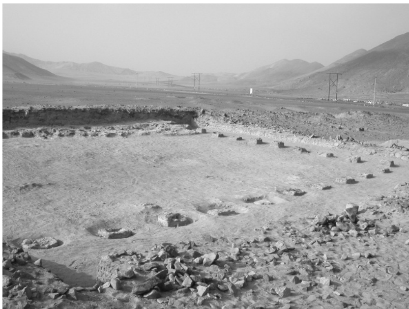
8.9. At the Early Horizon district center of Huambacho, on the coastal plain of Peru, the large open courtyards, one of which is shown here, were used for periodic feasting by the general populace, while the colonnaded periphery was probably reserved for elite participants who benefited from the shade.