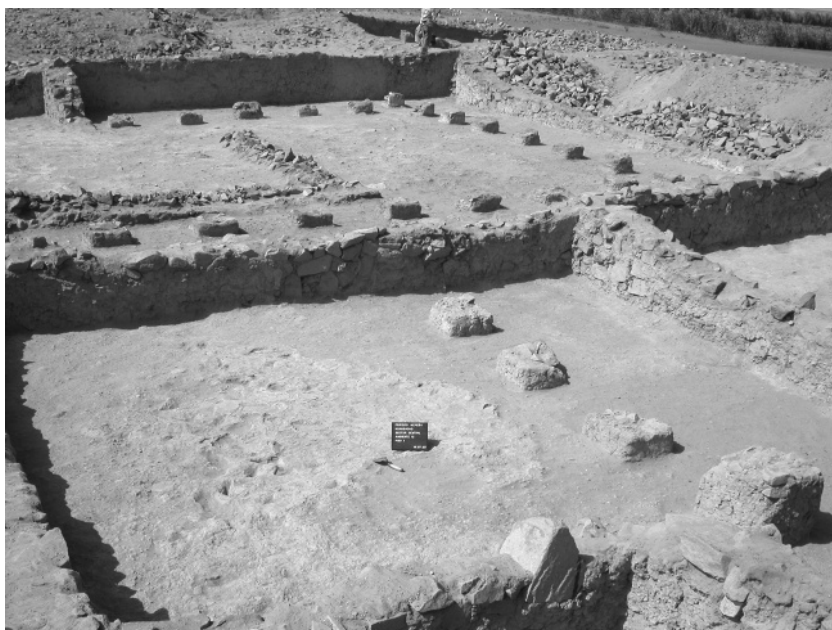
8.10. Much smaller patio and room complexes at Huambacho also appear to have been used for feasting, but for smaller groups of participants probably consisting exclusively of elites.