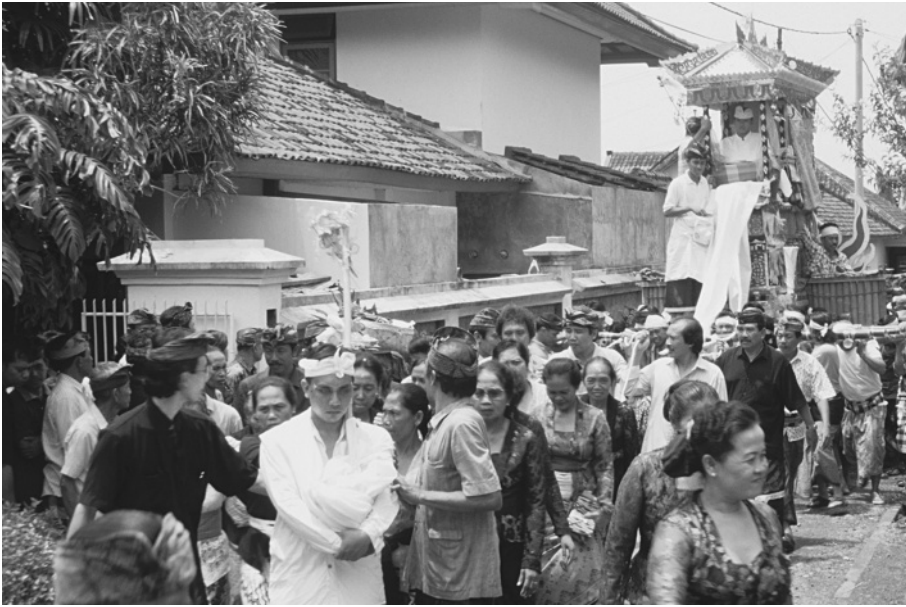
8.2. Although there no longer are royal funerals in Bali (Indonesia), important and wealthy individuals are still commemorated with large, colorful processions and feasts when they die. This funeral procession was for a wealthy and influential individual.

continuity in rulership and to maintain the dynastic grip on power. The Balinese funerals were the most dramatic, splendid, large, and expensive of all the royal Balinese displays requiring three months of ceremonies including three days of major events (Figure 8.2). They promoted the ideology that worldly status has a cosmic base and that hierarchy is the governing principle of the universe. Similar events, ideologies, and strategies were probably quite common in early states everywhere.