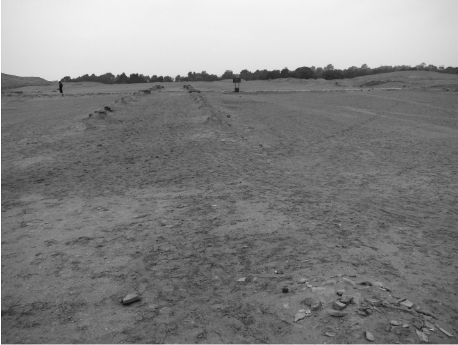
8.12. The Inca established huge spaces for periodic large gatherings of their subjects, which undoubtedly included large-scale feasting. This example of an Incan plaza is at Pachacamac, the most important ritual site on the Peruvian coast at the time of conquest. The plaza extends between the low mounds on the sides (c. 100 meters) and almost to the tree line on the far horizon (c. 300 meters)

empire. There were certainly some large-scale events involving many people, as attested to by the deposit of 1,000 ceramic vessels near the Templo Mayor in the Aztec capital (254). These may have been for some of the large feasts, described by Sahagun, that rulers gave for the general populace to pacify any discontent (Anderson and Dibble 1981:96–8). As in Sumeria, “pleasure girls” (courtesans) were used to attract people to the events, although they reportedly only took the hands of nobles and warriors. The ball courts, too, continued to be used as venues for feasting, predominantly by elites and as an element in political strategies. In addition, there were many temple feasts at which commoners made food offerings especially upon the “arrival of the god.” Contributors sometimes received some food back as part of a feast (Anderson and Dibble 1981:7,16,21–3,29,36,97,128,149,153,159–62), again indicating that Aztec temple feasts may have been used for gathering tribute as an effective revenue-producing strategy similar to strategies used elsewhere. If that did not suffice, there were also occasions when priests performed dances at houses and expected to be given food, or they went from house to house to request food, with maize going to the temple granary (62–4,84). Sahagun reports a surprising number of household-based feasts