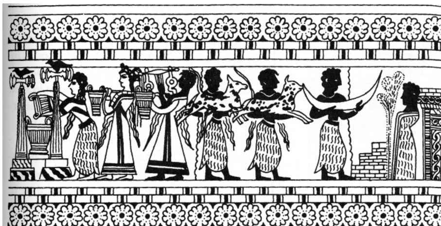
8.7. The importance of funeral feasts and lineages in Minoan early state societies is clearly illustrated in this depiction from the Hagia Triada sarcophagus (Crete). Celebrants can be seen bringing to a tomb with an ancestral statue before it drink (probably wine), undetermined foods, and calves to be sacrificed. Note the exclusive and predominantly elite status of the participants.

to be constructed and used to hold lineage feasts that reified the power of lineage heads and the land resources that they controlled (Freedman 1965, 1970) (Figure 6.17).