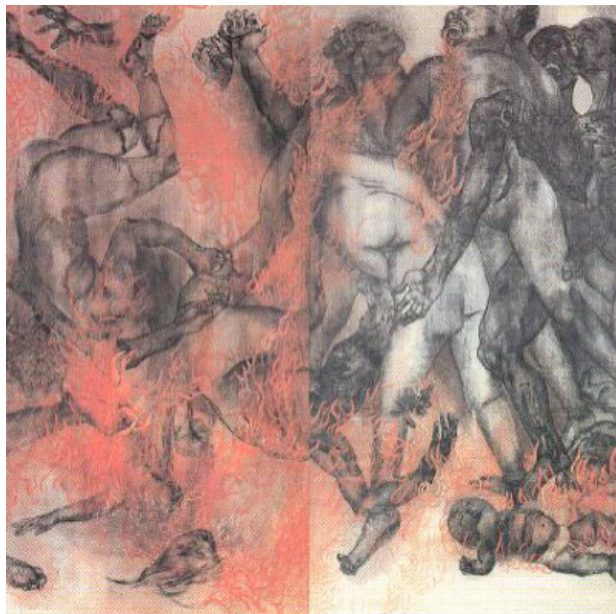
“Fire”, Panel 2 of the Hiroshima Panels, by Iri and Toshi Maruki (Collection of the Hiroshima Panels Foundation Maruki Gallery)

It is 63 years since mushroom clouds over Hiroshima and Nagasaki ushered in the nuclear age. The attacks on the two cities are now solemnly commemorated on 6 and 9 August, when the two city mayors issue their messages calling on the world to disarm, messages as necessary as they are certain to be ignored by the powers.