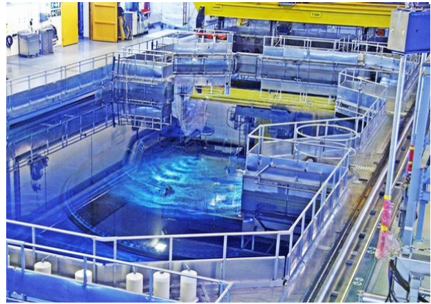
Inside the Forsmark reactor, Sweden

France’s EDF power plant spilled 75 kg of uranium into local water systems at Tricastin in July 2008. In Japan in July 2007 the world’s biggest reactor, at Kashiwazaki-Kariwa in Niigata, was struck by an earthquake 6.8 times stronger than was allowed for by the design and it was found to have been constructed directly atop a fault line.