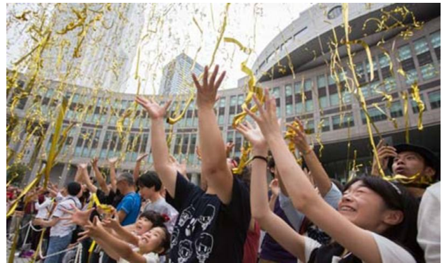
Celebrating the IOC decision in Tokyo

Between 2012 and 2014 we posted a number of articles on contemporary affairs without giving them volume and issue numbers or dates. Often the date can be determined from internal evidence in the article, but sometimes not. We have decided retrospectively to list all of them as Volume 10, Issue 54 with a date of 2012 with the understanding that all were published between 2012 and 2014.